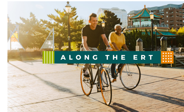
Visit Norfolk provides the “Along the ERT” pass where trail users can receive discounts and prizes by checking in along the ERT!